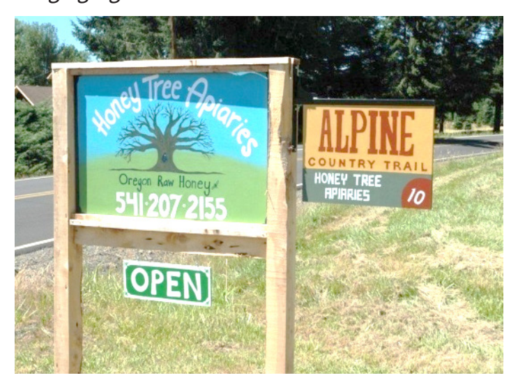
Honey Tree Apiaries is a farmstop on the Alpine Country Trail. The Farm Trail sign is attached to the regular entrance sign.

Farm Trails have permanent identity signs that are either installed on a single wooden post, or a smaller version is attached to a farmstop's existing entrance signs. These Farm Trail identity signs use a standard brand, with their design using the same colors, fonts, and size. Information included on the identity sign include the name of the farm trail (dominant), name of farm, and farm trail number. Some of the farmstops are information centers for the Farm Trail, designated by a small "Info. Center" hanging sign or "rider."