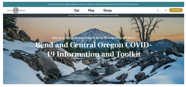
Important information regarding COVID-19 in Bend and Central Oregon