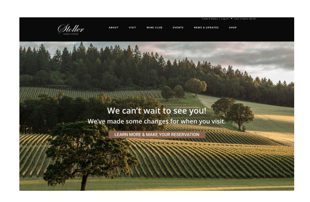
Stoller Family Estate