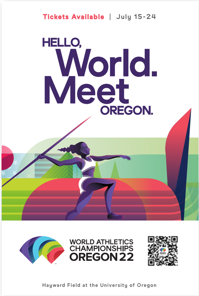
Window Cling 4" x 6"