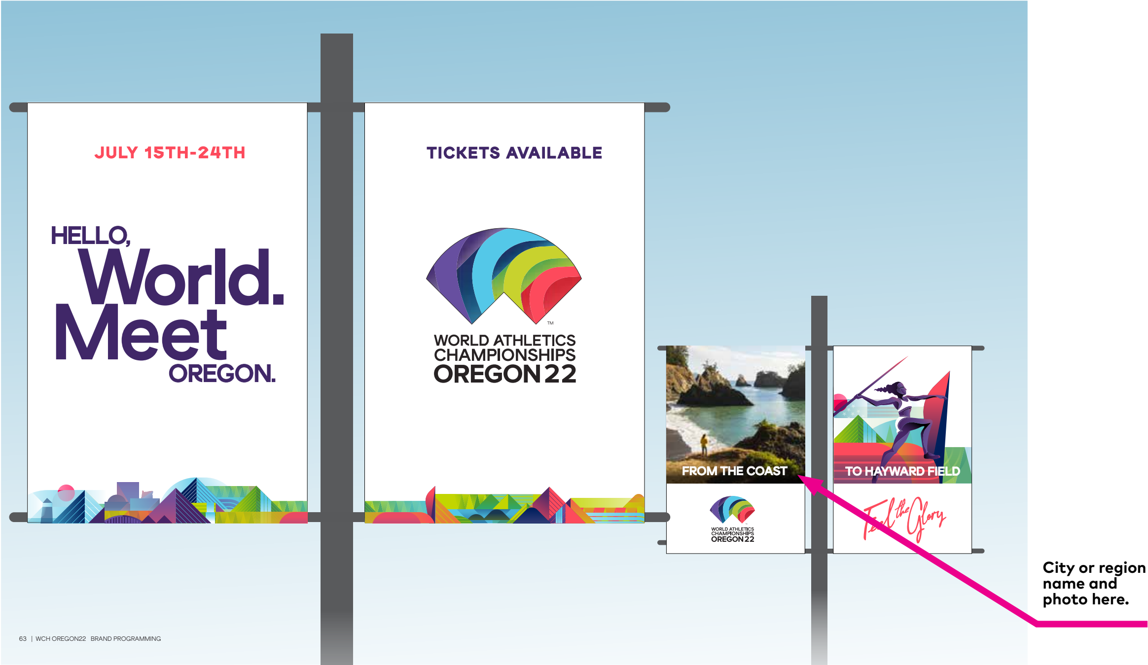
Street Pole Banners – 24" x 36"