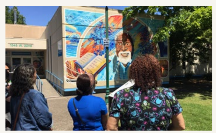
Stop on the Strides for Social Justice tour

Strides for Social Justice — a PeaceHealth initiative developed in partnership with the Eugene Marathon — recently launched as an inclusive, family-friendly app